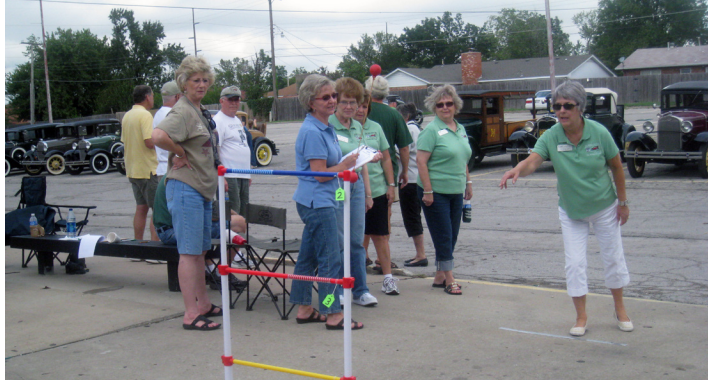
The Rumble Sheet - 9 - October, 2010