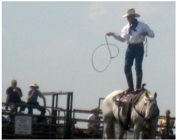
The Rumble Sheet - 2