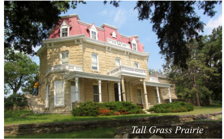
Tall Grass Prairie

Ralph Hudson competes in radiator fill during car games.