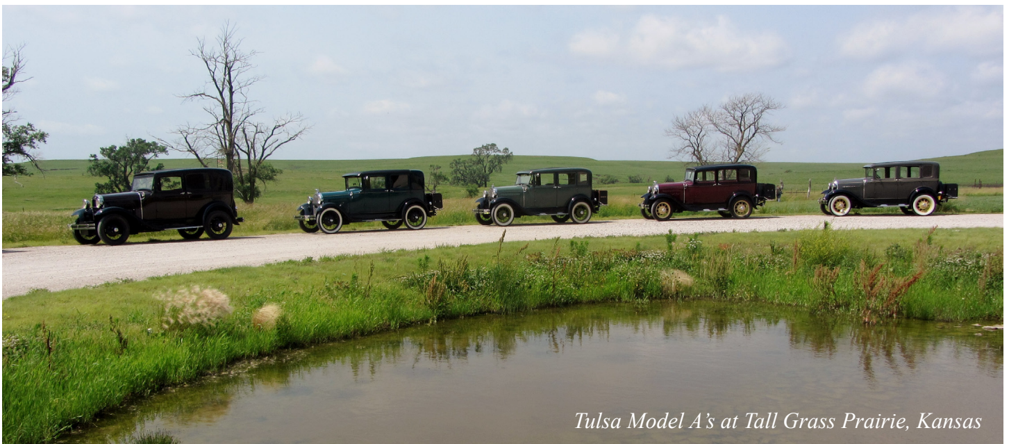
Tulsa Model A's at Tall Grass Prairie, Kansas