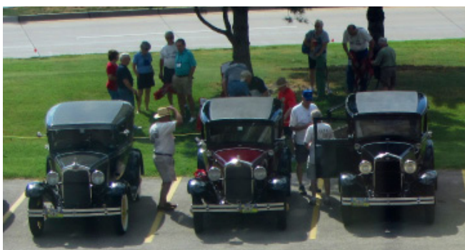
Tulsa Lineup in Wichita