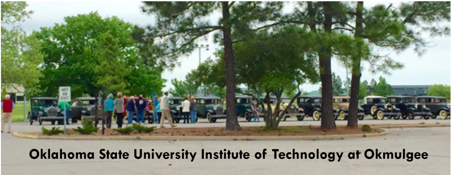
Oklahoma State University Institute of Technology at Okmulgee