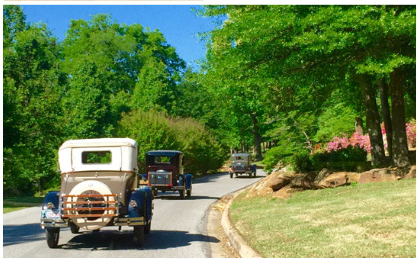
THE RUMBLE SHEET - 10 - JUNE 2015