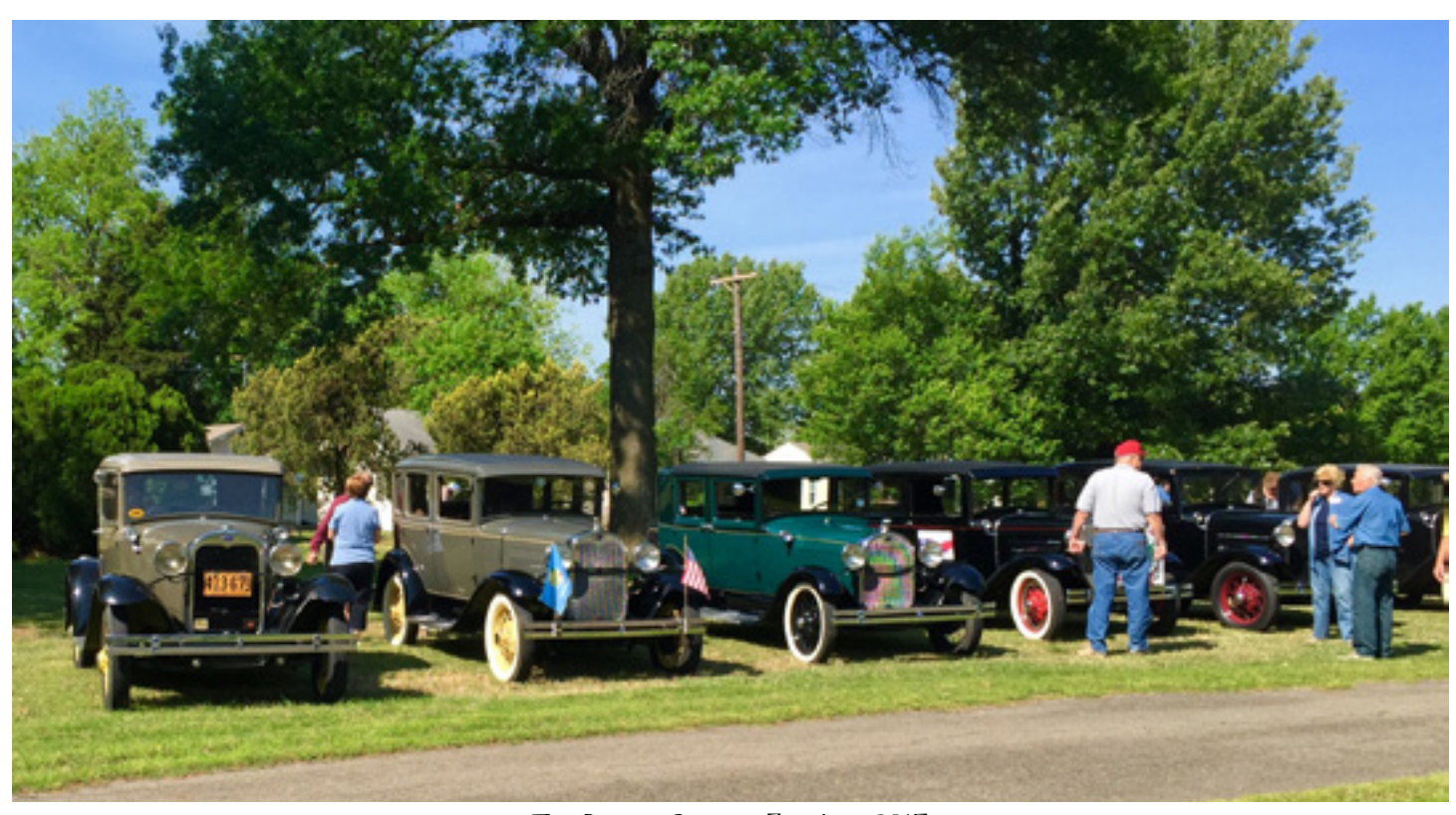
THE RUMBLE SHEET - 7 - JUNE 2015