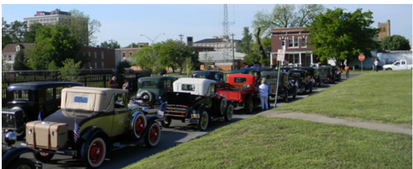
THE RUMBLE SHEET -8 – June 2015