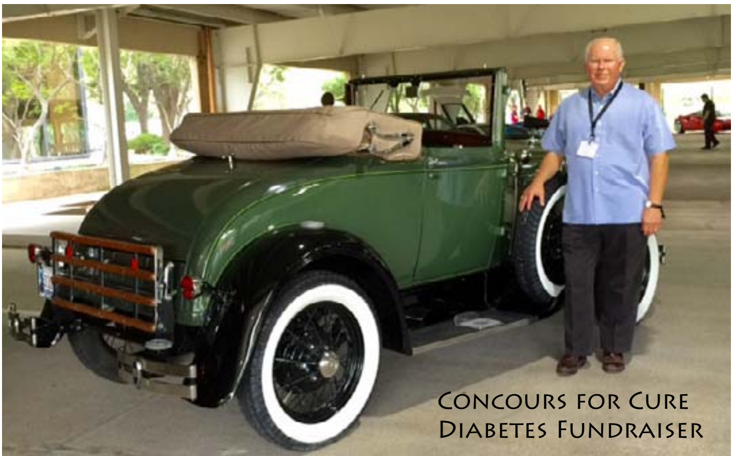
CONCOURS FOR CURE DIABETES FUNDRAISER