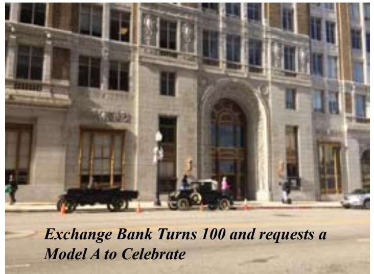
Exchange Bank Turns 100 and requests a Model A to Celebrate

Please send all your reports for the membership to: Linda Mellage 918-629-2978