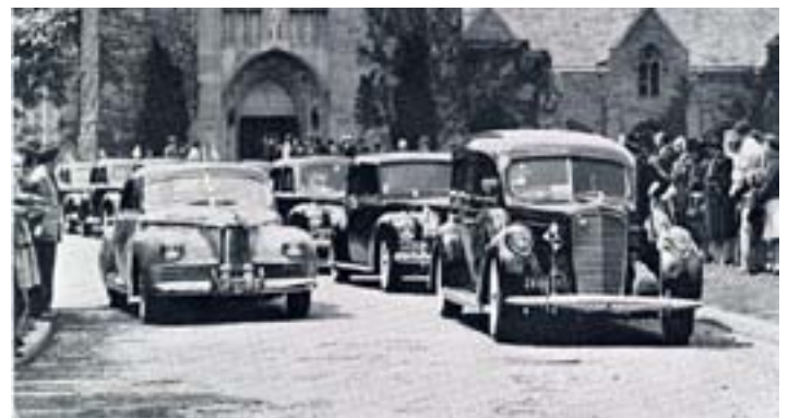
Edsel B. Ford's funeral procession May 29, 1943. 1938 Eureka-Lincoln hearse. Ford family limousines, including one of three Brunn-bodied Lincoln Zephyrs lined up behind the hearse.

These stories appeared in the May edition of the Script "A" Newsletter.