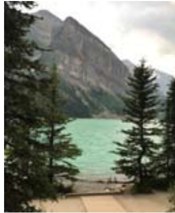
Bullard Rocky Mountain Tour - Roosevelt Arch at Yellowstone, Lake Louise, Banff, and Glacier National Park