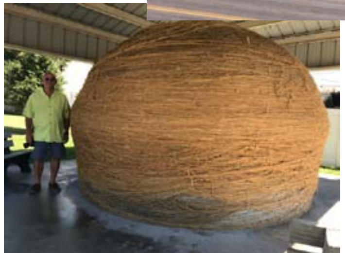
World's largest ball of twine.