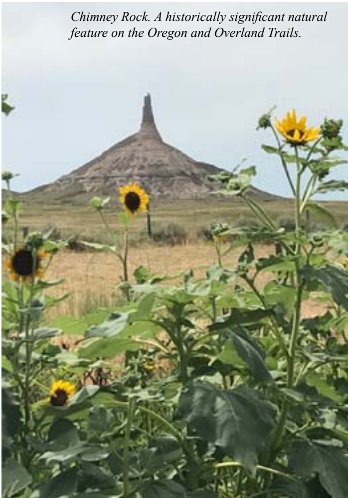
Chimney Rock. A historically significant natural feature on the Oregon and Overland Trails.