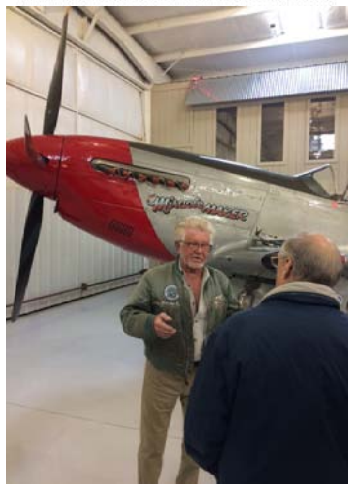
THE RUMBLE SHEET - 6 - FEBRUARY 2018