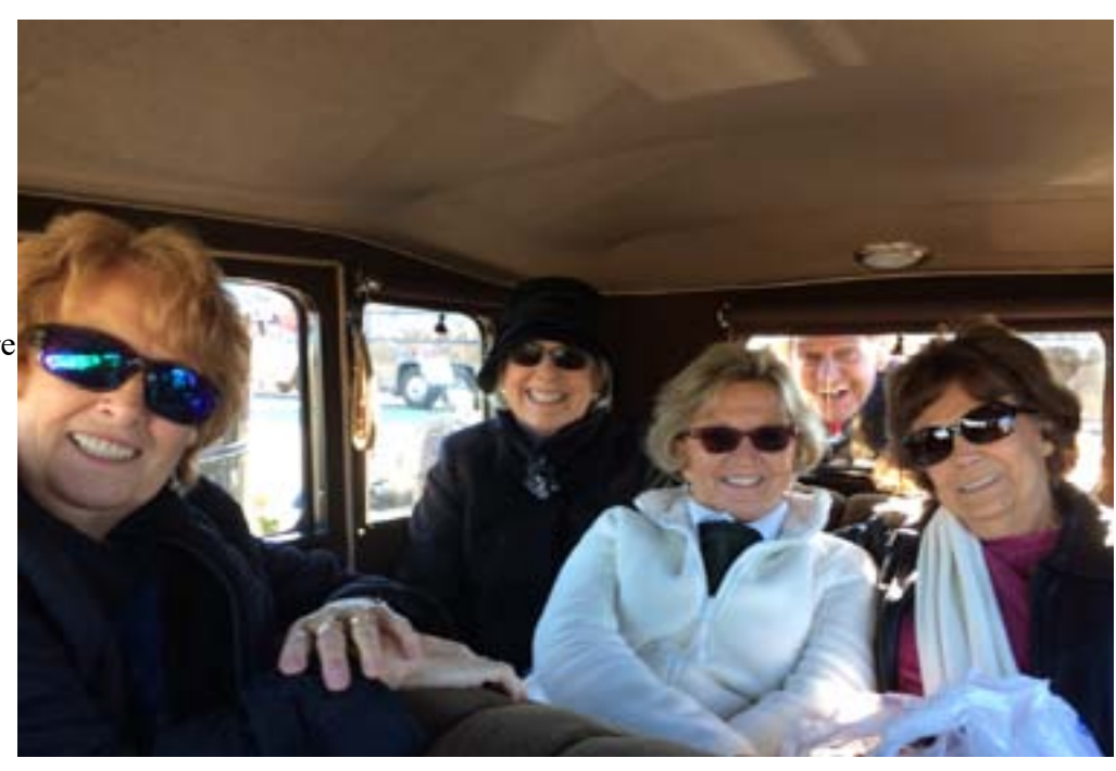
THE RUMBLE SHEET - 2 - FEBRUARY 2018