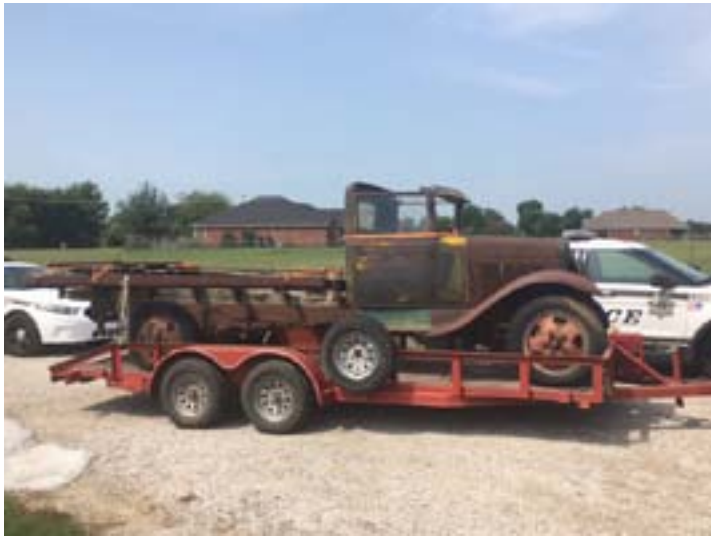
The latest Ramsey/Hudson restoration project: 1931 1 1/2 Ton (big iron)