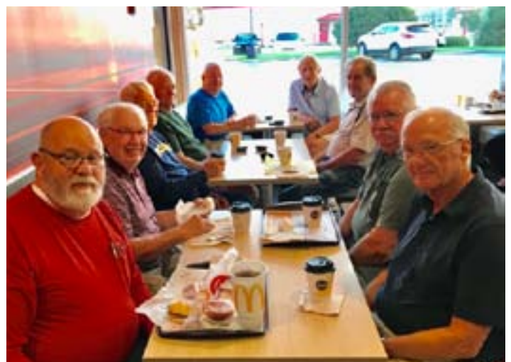
About a dozen men from our club meet every Tuesday morning for coffee. They begin gathering around 7 a.m. at McDonalds, South Memorial at 91st. Come join the group.