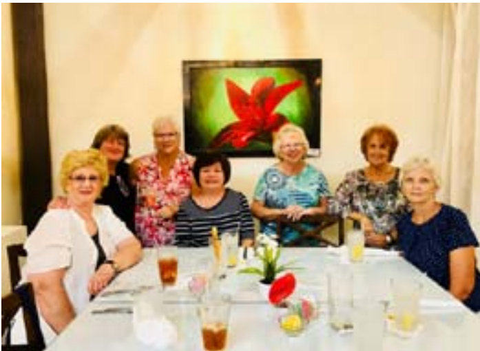
Ladies' Lunch is monthly at 11:30 a.m. on the second Tuesday of the month. The location changes monthly and is listed in the Rumble Sheet calendar. All women of the club are welcome. This group dined at Kiss Me Quik Cafe in August.