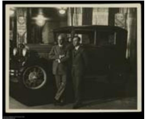
Henry Ford and Edsel Ford Introducing the 1928 Ford Model A at the Ford Industrial Exposition in New York City.

Sunday-Thursday 7am-9pm Friday-Saturday 7am-10pm