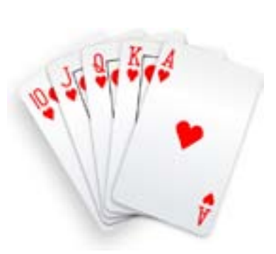
THE RUMBLE SHEET - 6 - FEBRUARY 2019