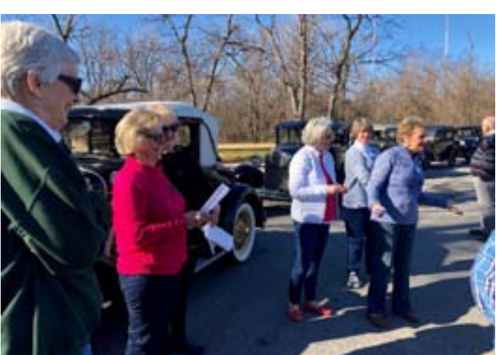
THE RUMBLE SHEET - 3 - FEBRUARY 2019