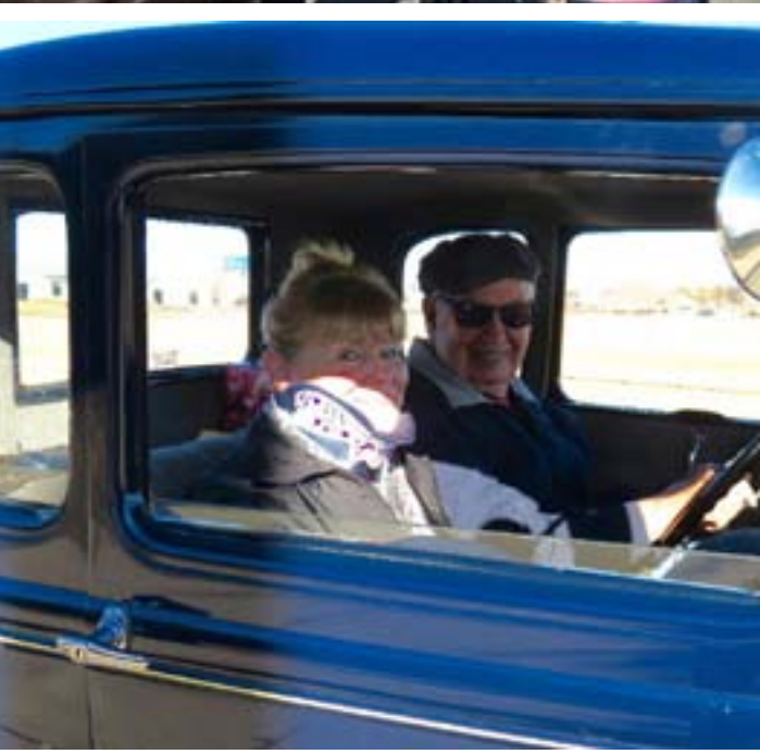
THE RUMBLE SHEET - 5 - FEBRUARY 2019