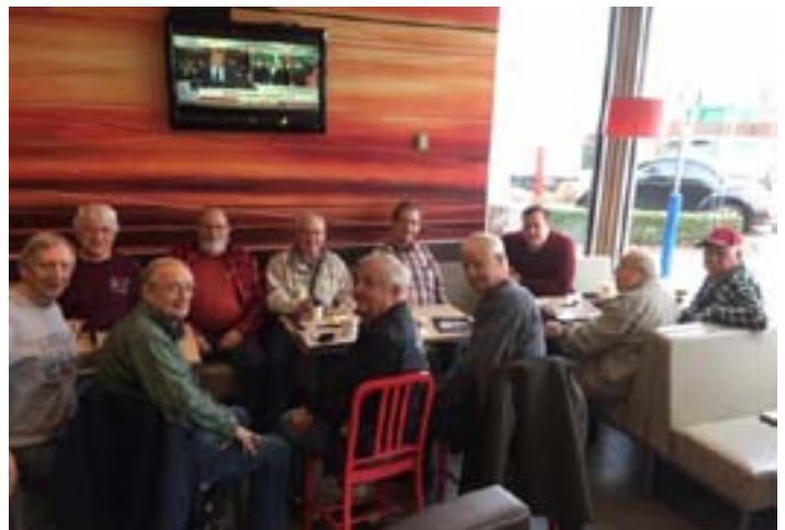
>Solving world problems at breakfast.