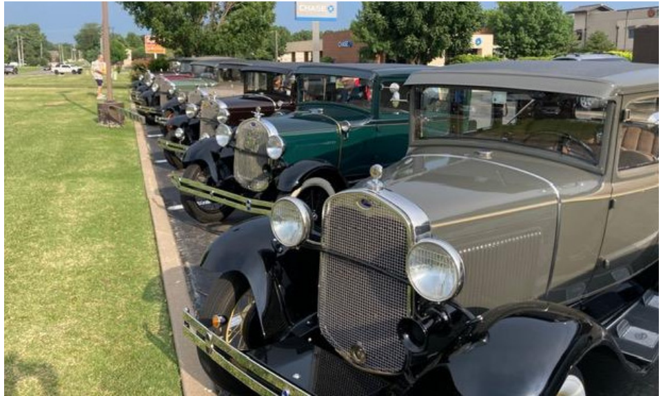
McDonald's car display Tuesday mornings.