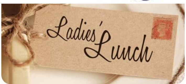
September 14, Jhursday 11:30 Catoosa Lodge 2036 South Miller Lane, Unit Ø