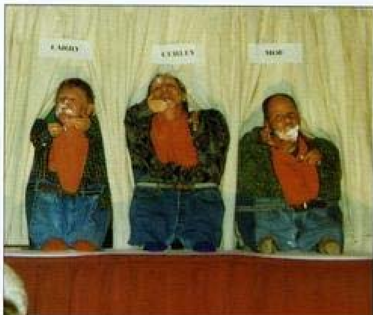
The Sooner A's one act skit, "Getting Larry, Curley and Moe Ready for the Model A Club Regional" brought the house down.