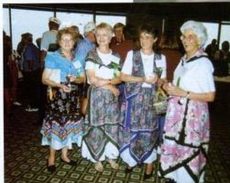
Above: Bandana scarf dresses worn by host club ladies for the welcome party.